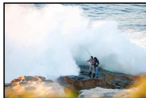
Anglers at rock pools in Randwick (before shot)

4 people are stuck in a rip at North Wollongong after patrol hours. The Police activate 13SURF and local Duty Officers and lifesavers respond and rescue the 4 patients with the assistance of local surfers.