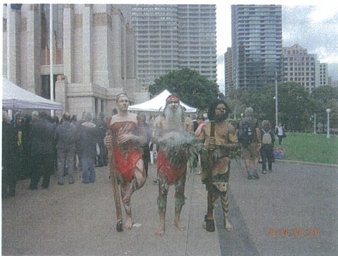
Participants at the Indigenous Veteran's Ceremony 2014