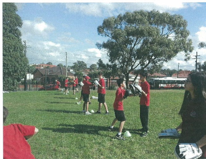
Tempe PS students at Sporting Leadership day